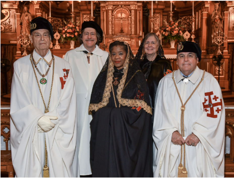
Lieutenant General Agostino Borromeo represented the Grand Magisterium in Chicago