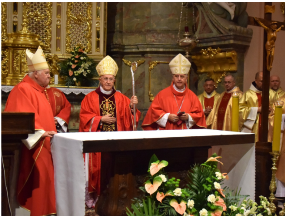
The Mass at Miechów presided over by the Grand Master of the Order.

Also gathered for the occasion were members of the Polish Lieutenancy of the Order and all other participants in the Jerusalem Days. The event has been held biennially in Miechów since 2010 with the special intention of praying for the Holy Land. The Grand Master went on to say, "Since the faith in the Risen One, the Son of God, was preached in this noble land of Poland, God Himself has cast His benevolent gaze upon those who dwell here. Historically, with the spread of veneration for the Holy Sepulchre in 16th century Miechów, there was a desire to replicate the Aedicule of Christ's Tomb. In reality, the Lord's Holy Sepulchre does not represent just one of the many, albeit significant, places in the life of Jesus, but the symbolic place that encompasses the mystery of His painful Passion and glorious Resurrection; the place where the entire mission of Christ found its fulfillment, as Jesus Himself said, 'Unless a grain of wheat falls into the earth and dies, it remains alone; but if it dies, it bears much fruit' (John 12:24)."