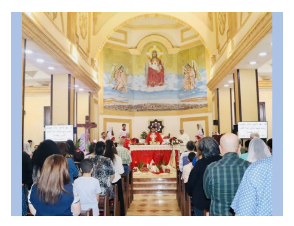
Renovation of spaces for the Catholic Church in Jordan

The Lieutenancy for Germany financed the renovation of the Latin parish in Smakiyeh, which covered the church, the priest's house and the multi-purpose hall. The parish, which is located in a marginalized area outside the capital Amman, had not been renovated for decades. Thanks to this project, the Latin Patriarchate was able to create a pastoral environment suitable for living, praying and participating in masses and parish events.