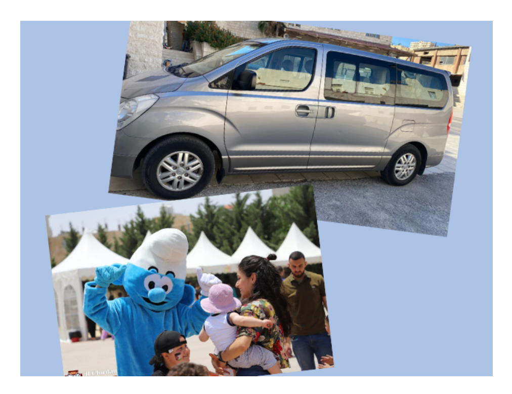
Purchase of a new minivan to support youth pastoral activities

JEC Jordan (Christian Student Youth) needed a reliable vehicle to transport its members to various organized activities, including training courses, workshops, spiritual meetings, camps, sports activities and educational trips. Thanks to a generous donation from the Dutch Lieutenancy , the Latin Patriarchate was able to purchase a minivan to support these activities. A dozen members of the General Secretariat of JEC, fifty members of the Work Commission, priests, nuns and spiritual leaders of JEC, can now benefit from this purchase, which also allows all members in Jordan, especially those from the more remote villages, to take part in the masses, events and religious celebrations organized by this dynamic movement.